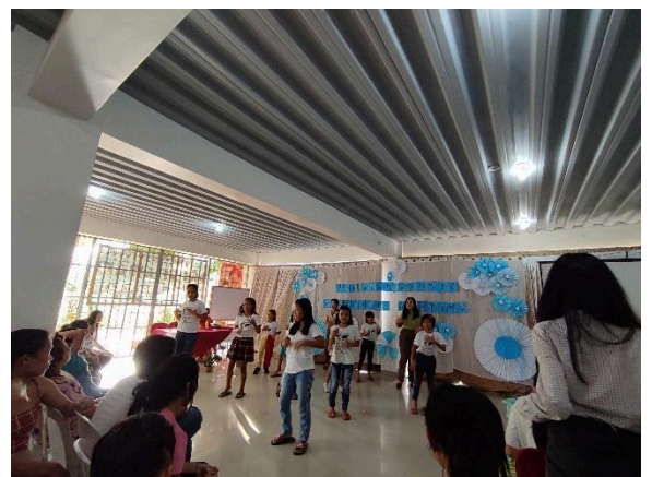
Social Work Interns from City College of El Salvador and University of Science and Technology (USTP) Claveria showed their dance presentation as well as the Yellow, Green, and Blue House, Safe Home for Boys and Independent Living.