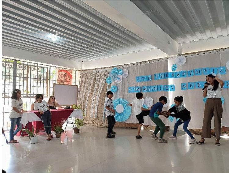
The Blue House led the program. The MCs (Barvie & Amehan) acknowledge the presence of everyone who joined. Before the program started, MC Amehan did the preliminary game called Bring Me to catch the children's attention while waiting for others to be in the hall.